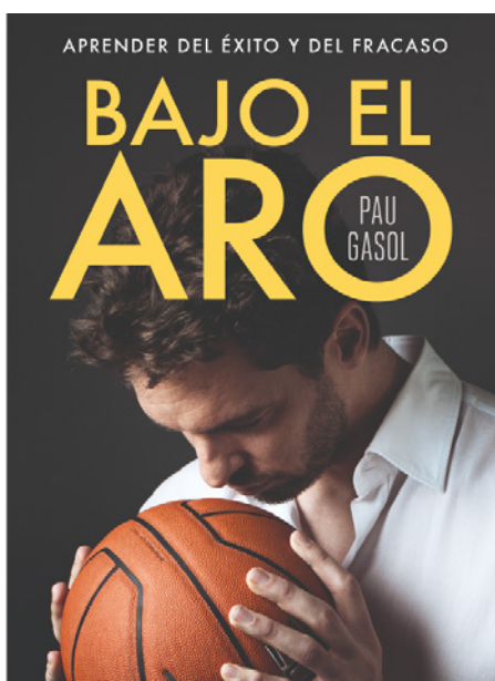
BAJO EL ARO, 2018