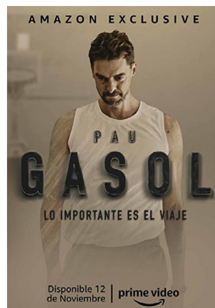
LO IMPORTANTE ES EL VIAJE, 2021